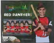
1 - 8x10 Memory Mate