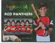
1 - 8x10 Memory Mate