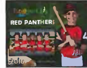
1 - 8x10 Memory Mate