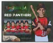
1 - 8x10 Memory Mate